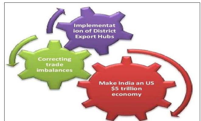
Diagram 3: The Plans of the Ministry of Commerce and Industry for the new policy

There is persistent demand from the industry to correct the imbalances in India’s International trade processes; discussion has been done to reduce the constraints in the global market regarding the policy and procedure of FTP, lower the transaction cost, and enhancing the ease of doing business.