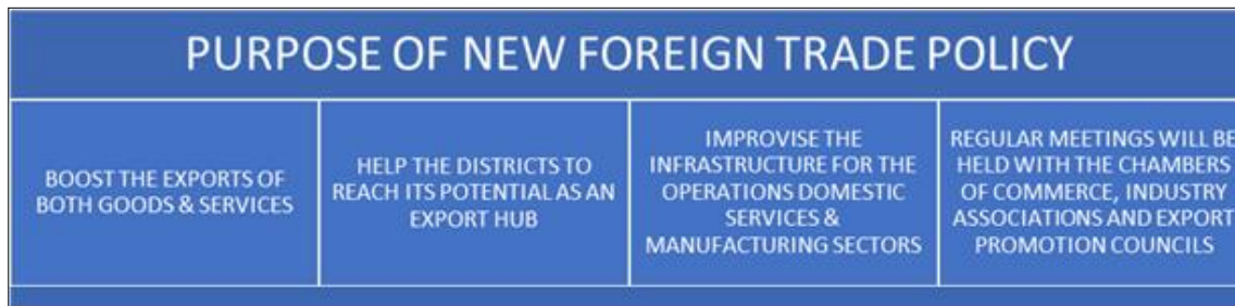
Diagram 2: Aims of New Foreign Trade Policy

The main aim for the policy would be to make India a leader in International Trade in the next 5 years. The Government has many other purposes behind the New FTP which is presented in below graph: