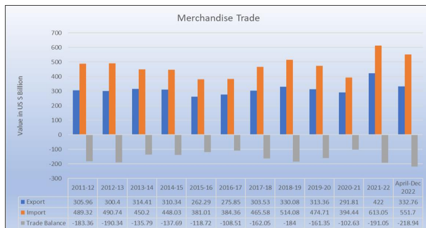
Table 2: India Merchandise Trade of Goods Since 2011-12 to April-Dec 2022.

Imports during 2021-22 registered an increase of 55.43 per cent from US$ 394.44 billion in 2020-21 to US$ 613.05 billion in 2021-22. Import during April-December 2022(QE) stood at US$ 551.70 billion, an increase of 24.96 percent compared to US$ 441.50 billion during April-December 2021. Thus the trade deficit in 2021-22 was estimated at US$ 191.05 billion as against the deficit of 102.63 billion in 2020-21. In April-December 2022(QE), trade deficit increased to US$ 218.94 billion from US$ 136.45 billion in April-December 2021. The overall trend of Merchandise trade (Export and Import of Goods and Services) in India are presented in the table below: