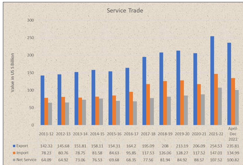
Table 3: India Merchandise Trade of Services Since 2011-12 to April-Dec 2022.

compared to US$ 184.65 billion in April-December 2021, which is a positive growth of 27.71 per cent. Services imports were US$ 147.01 billion in 2021-22 as compared to US$ 117.52 Billion in 2020-21, a positive growth of 25.09 per cent. The cumulative value of imports during April-December 2022 was US$ 134.99 billion, registering a positive growth of 28.01 per cent vis-à-vis April-December 2021. A surplus of US$ 107.52 billion and US$ 100.82 billion was generated in services trade in 2021-22 and April-December 2022 respectively. The broad trends in Services Exports, Imports and Trade Balance in the last ten years are given in the table below: