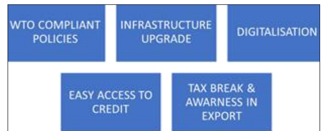
Diagram 1: Expectation from the New Policy

The Foreign Trade Policy in India is basically a set of rules and regulations for promoting the import and export of goods and services from the country. The policy is framed by the DGFT (Directorate General of Foreign Trade) under the Ministry of Commerce & Industry. The Current Foreign Trade Policy was introduced on 1 st April 2015 for the period of 5 years. The key expectations from Foreign Trade Policy 2021-26 are presented in below diagram-